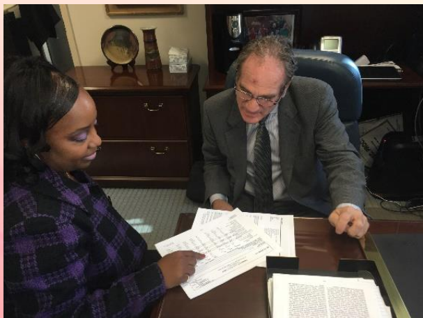
Attending Bronzeville Children's Museum Women's Board, Kwanzaa in July Fundraiser.