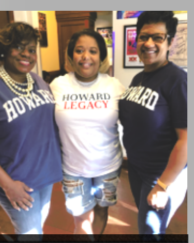
Supporting an HBCU event with fellow Howard Alums and Rho Theta Omega Chapter members