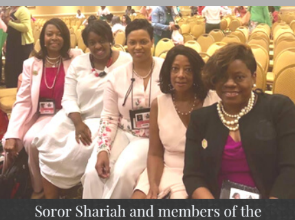
International Investment Committee